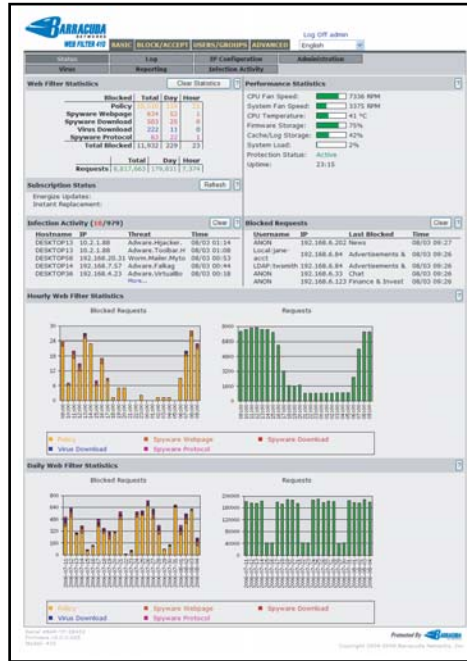
System Administrators can use the intuitive Web interface for detailed monitoring and maintenance.

With no software to install or network modifications required, the Barracuda Web Filter is easy to set up. System (Energize) updates are delivered automatically by Barracuda Central, an advanced technology center where engineers work continuously to provide the most effective methods to combat the ever changing spyware and virus variants. Energize Updates are distributed hourly for continuous protection against the latest threats.